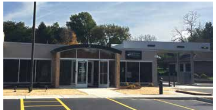
New Kenosha (top) and Edgerton (bottom) locations are open