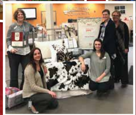
Some of the many displays at our branches (from left to right): Delavan, Kenosha 75th St., Court St., Deerfield Dr. and Milton